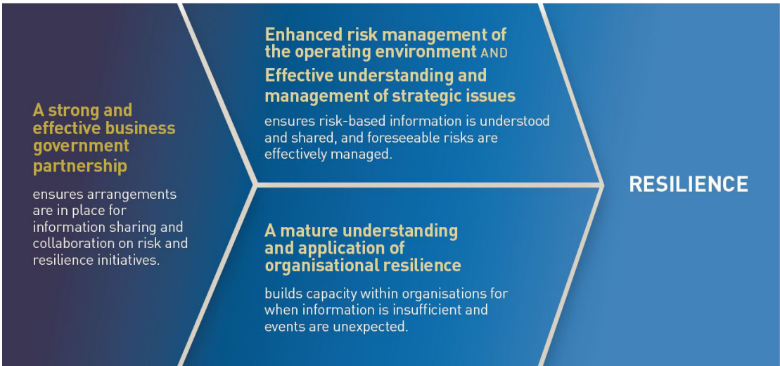
Figure 2 shows how the four outcomes work together to build overall critical infrastructure resilience

Outlined below are the four key outcomes that will be delivered through the Strategy. These outcomes will be used to assess the success of the Strategy when it is reviewed in 2020. A number of high-level activities are listed that will contribute toward each outcome, and in turn underpin the aim and objectives of the Strategy.